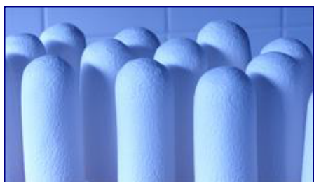
Our cellulose thimbles

Extraction thimbles.com cellulose extraction thimbles are made of fibers of noble cellulose and linters of cotton that are completely free from impurities .