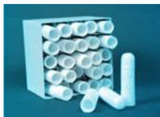
Glass microfiber thimbles

Our glass microfiber thimbles are made of borosilicate glass fibers that are 100% free of bonding agents.