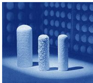
Quartz microfiber thimbles

Made with pure quartz microfibers completely free of bonding agents and later treated at high temperatures.